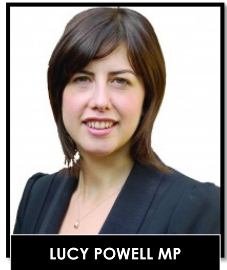
LUCY POWELL MP

Manchester Central Member of Parliament Lucy Powell said 'The Ancoats Dispensary is a fantastic building at the heart of my constituency of Manchester Central. I am pleased to support Ancoats Dispensary Trust's 100 days appeal to raise the funding necessary to kick-off the first stage of the project. I hope that people in Manchester will get behind the project and give their support.'