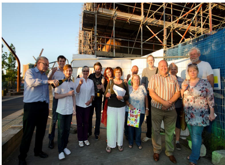
ADT Members celebrating their success outside the Dispensary on hearing the news of the Stage One LHF Funding bid.