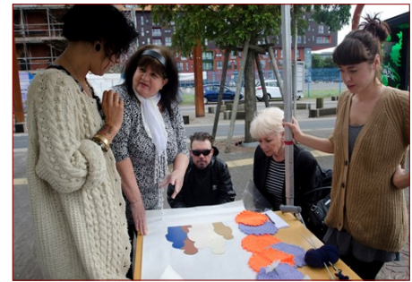
Residents of the Ancoats community busy working on the banner.